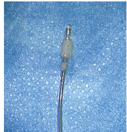
Fig. 3. Photograph of coagulum in egg whites mimicking the lesion performed in our case with the following contacts: 1(+) and 2(-) in the first session, and 3(+) and 2(-) in the second at 40 V for 30 s for each stage.

In our opinion, this procedure has to be considered for patients in whom thinness and severity of symptoms increase the chance of infection or erosion. Children affected by severe dystonia could benefit from this procedure, particularly those affected by status dystonicus, which by lesioning alone or combined with DBS in different targets (Gpi or nucleus subthalamicus [pers. experience]) could control dystonic symptoms. Staged RF le-